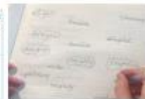
4. Try it